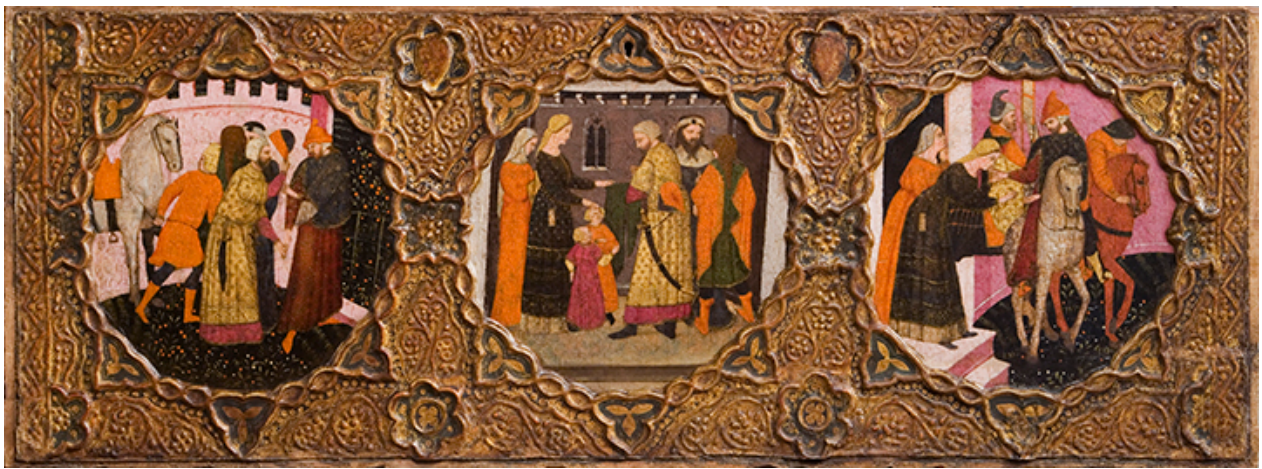
Master of Carlo III of Durazzo, The Story of Messer Torello and Saladin , wood, gold leaf, plaster, tempera on wood panel, 1380–1390 ca. Museo Stibbert, Firenze